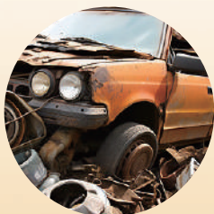
废旧汽车 scrap car